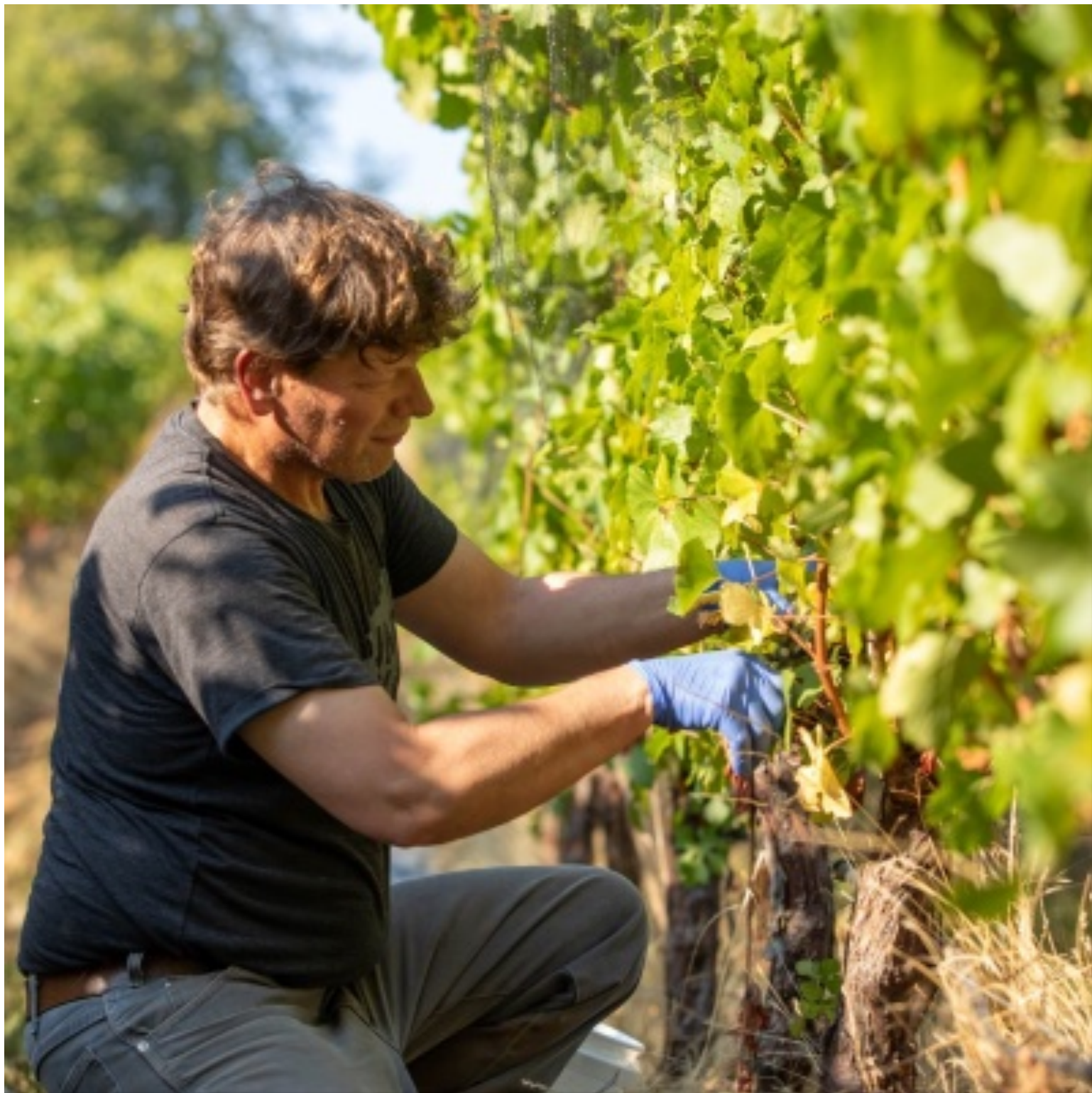
Chemeketa Wine Studies Program